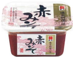
Photo is by 4 kgs. There are Aka Miso, Shiro Miso, Rice or Barley main used Miso and Blended Miso in other bigger packs. 4kg/10kg/20kg.